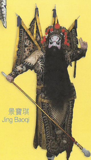
景寶琪 Jing Baoqi