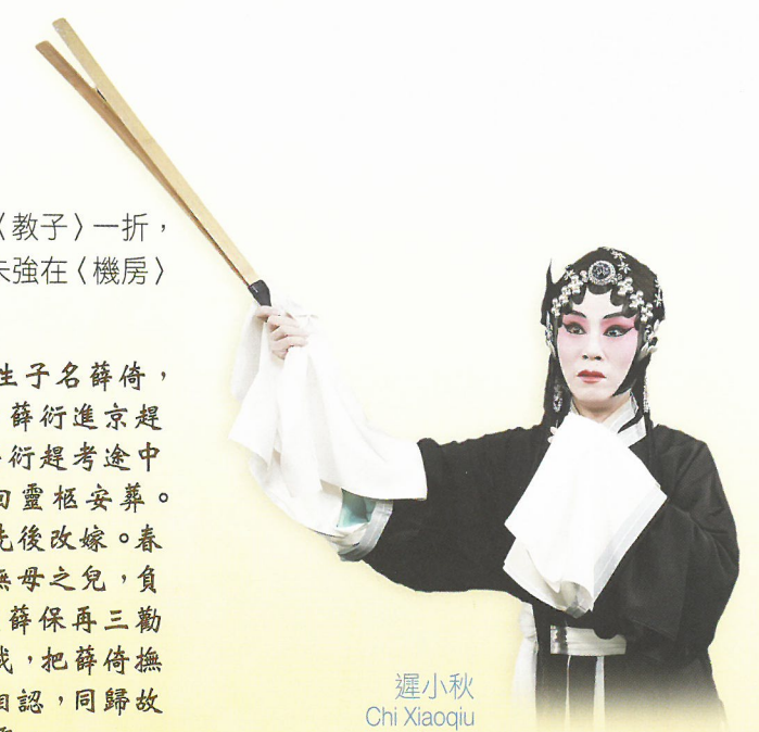
遲小秋 Chi Xiaoqiu